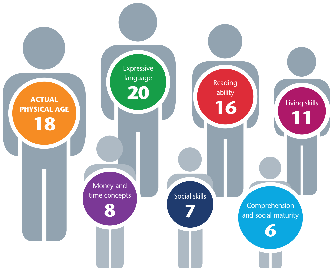
Example of developmental stages of 18 year old child with FASD

The diagram below shows common stages of development for a teenager with FASD. In some ways the young person may be developmentally average or indeed, ahead of their peers, yet, in other areas they may be well behind. Imagine how problems could be avoided if expectations were adjusted to match a child's ability.